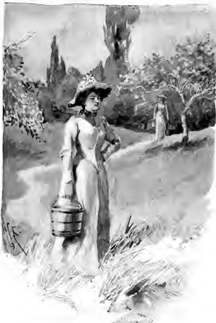
"ALENDIC MAIDS THAT HOMEWARD SLOWLY BEAR THE BRIMMING PAIL."—Page 39.